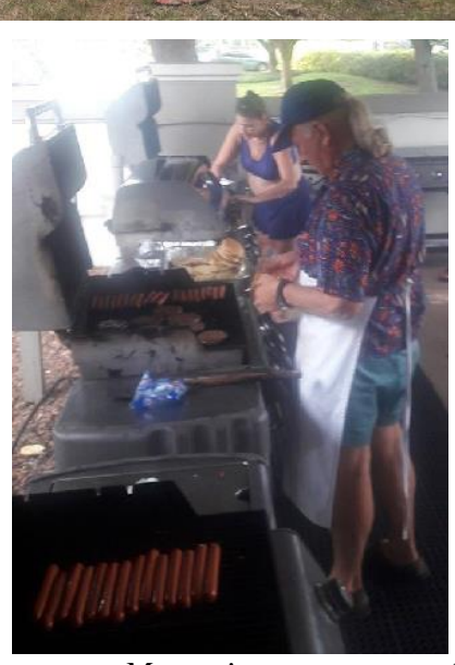
More pictures on page 3.