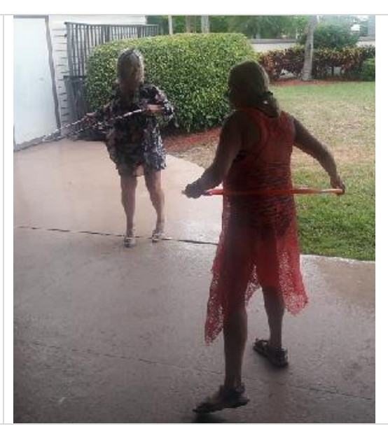
See more photos at our Facebook page.