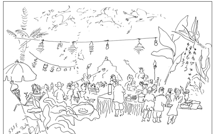
Buffet line (artist rendition)