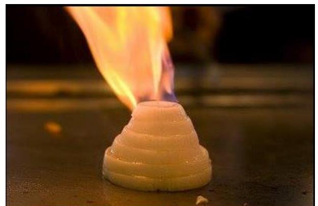
Volcano erupting (artist rendition)