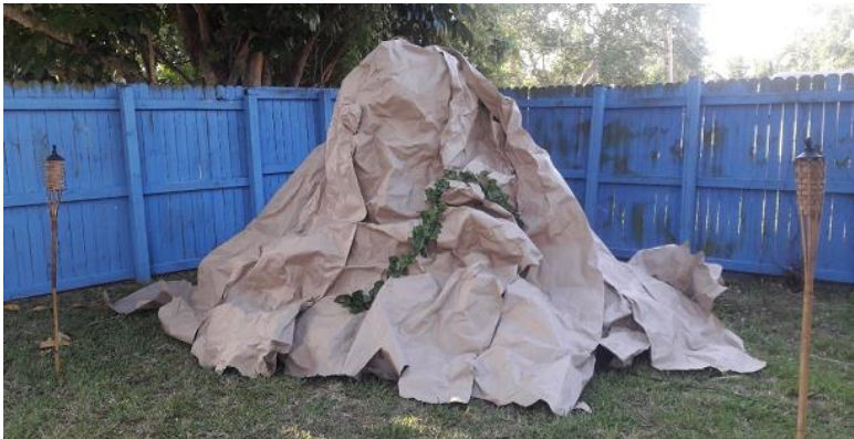
Volcano ready to erupt