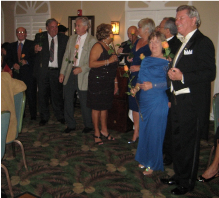
Past Commodores (needed both shots to get them all in)