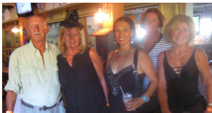
3rd Place: Mariposita