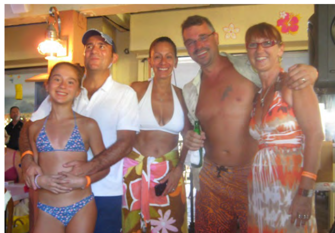
Best Decorated Boat: 'N Sync