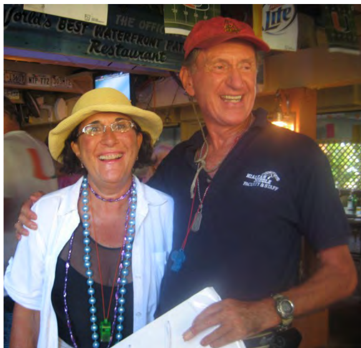
2nd Place: Enterprise