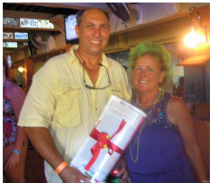
Best Land Cruisers: Soon Reach